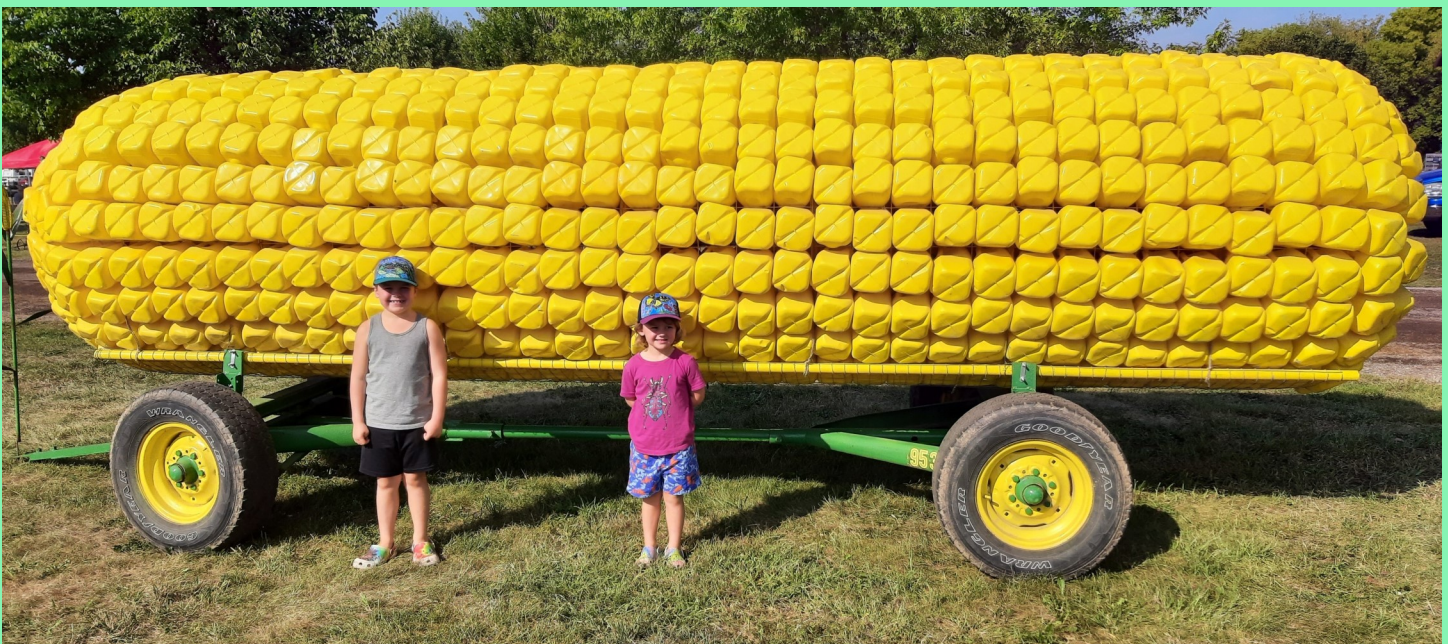
An impressive harvest on display at the Rice County Steam and Gas Engine's fall show in Dundas, MN